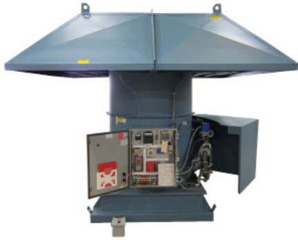
Vertical Econo Heater