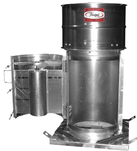
Swing-Out Roof Exhaust Unit