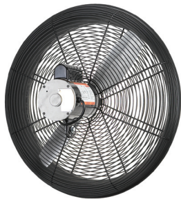
HartKool Cooling Fan